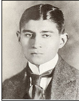
Franz Kafka, 1910